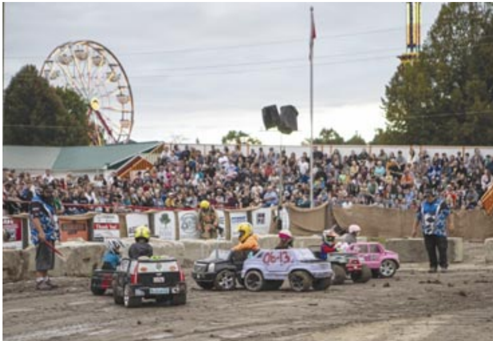
PINT-SIZED DESTRUCTION - Underage drivers took to the ring on Saturday evening at the Uxbridge Fall Fair, as Power Wheels Derby premiered just before the main event of the Demolition Derby. Kids from ages 5 - 9 took to their Derby-style painted Power Wheels and, according to one onlooker, "just drove around and banged into one another." For more on this year's fair, see page 3.

Busing still a bit of a bust • On the street where we live • Get artsy this weekend