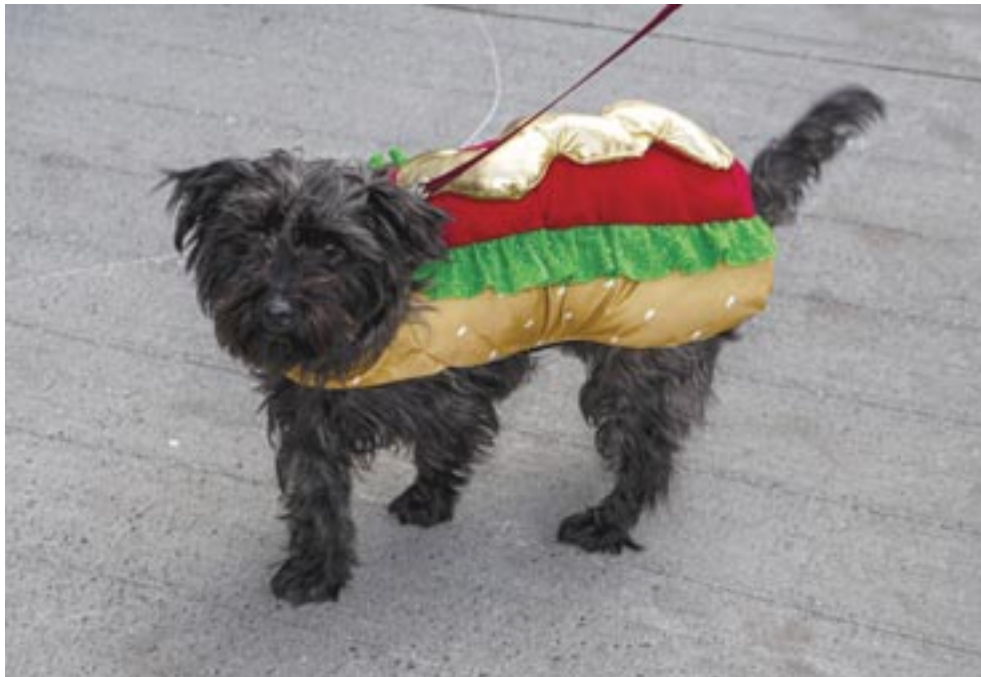
THAT'S ONE HOT HOT DOG! - Trick or treaters of all shapes and sizes - and species! - were out on Saturday afternoon to take part in the Uxbridge BIA's Spooky Saturday Trick-or-Treat Trail. This adorable pup (whose name we weren't able to discover) stole hearts with his portrayal of a tasty hot dog.

Urban park proving popular • Getting our goat • Bruins stuck in second