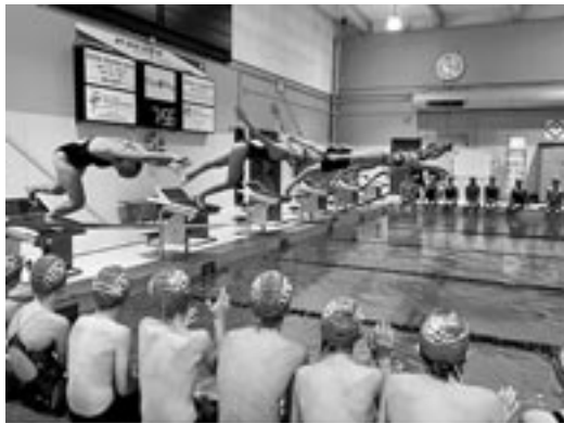
Six long-time members of the Uxbridge Swim Club "cut the ribbon" on new starting blocks at Uxpool.